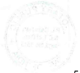
(Vishal Gandhi) Scientist 'E' Central Pollution Control Board

A handwritten signature in black ink, appearing to be "Vishal Gandhi", written over a horizontal dashed line.